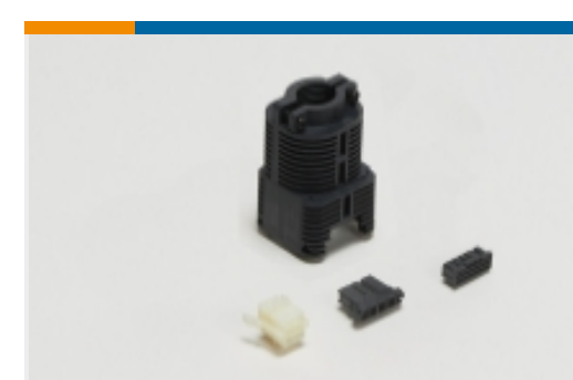
Rectangular Connector Housings(12)